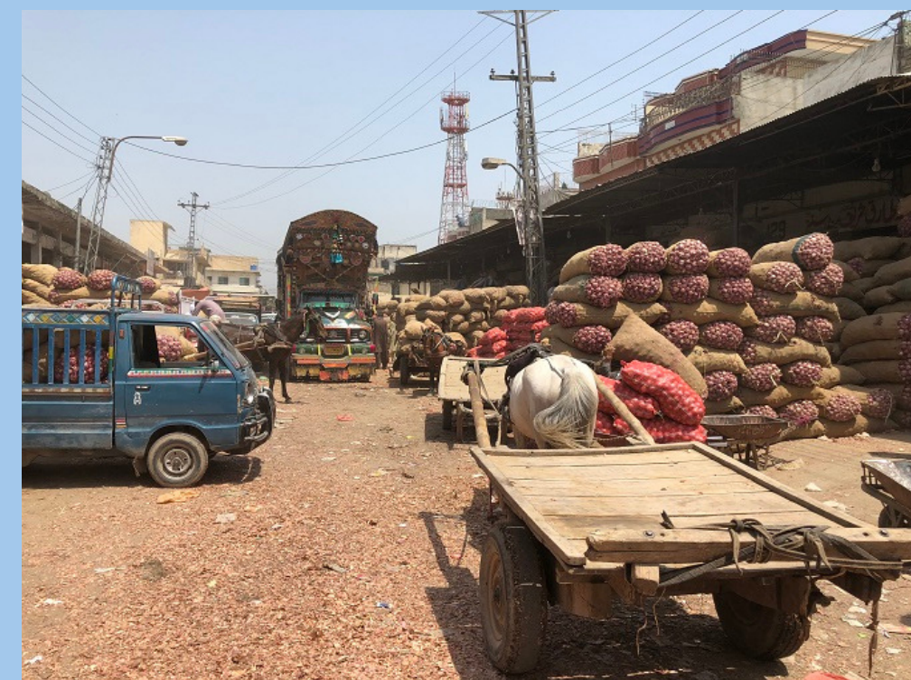
The GRASP project will work adopting a market down approach to improve business environment, value chains, and related services in the horticulture sector.